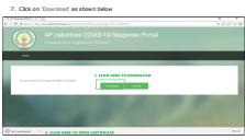
FIG - 7